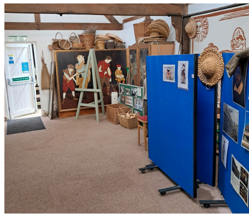
The Arden Workshop