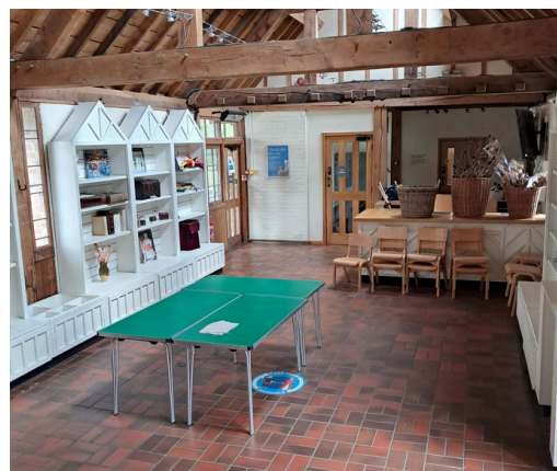
The Swan of Avon Studio